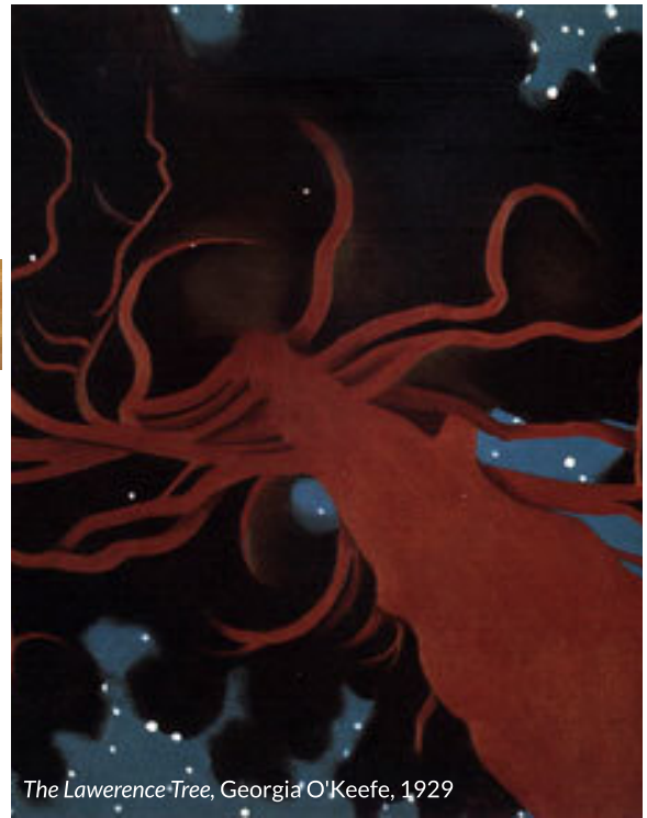
The Lawrence Tree, Georgia O'Keefe, 1929

(303) 722-7525 lourdesclassical.org 2256 S. Logan St Denver, CO 80210