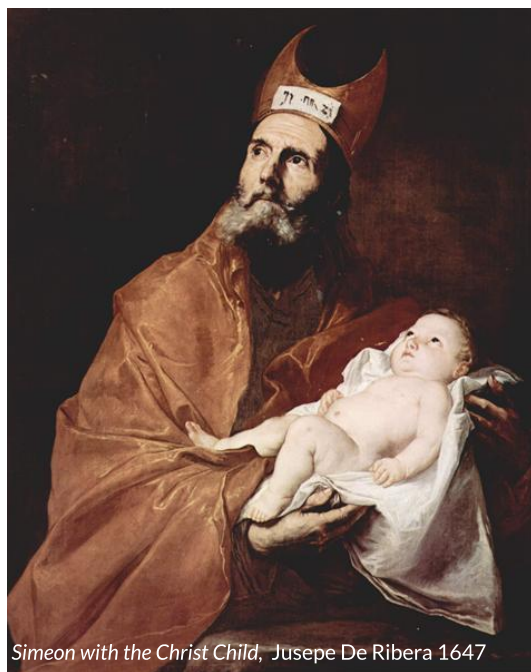
Simeon with the Christ Child, Jusepe De Ribera 1647

(303) 722-7525 www.lourdesclassical.org 2256 S. Logan St. Denver, CO 80210